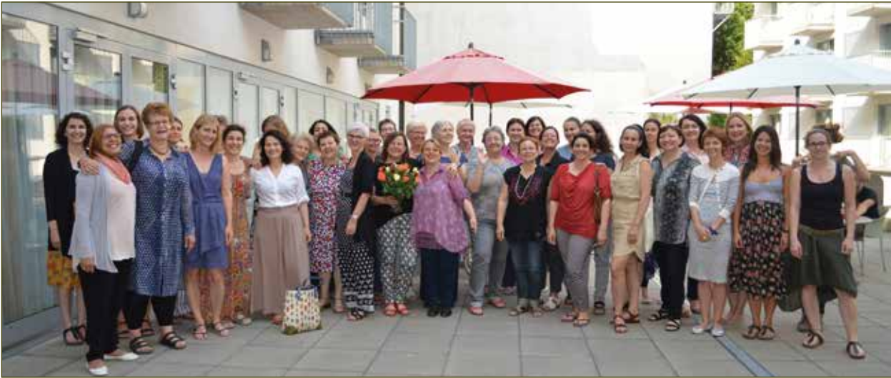
Meeting of the Advisory Board of Country Coordinators, CoCo (Vienna, Austria)