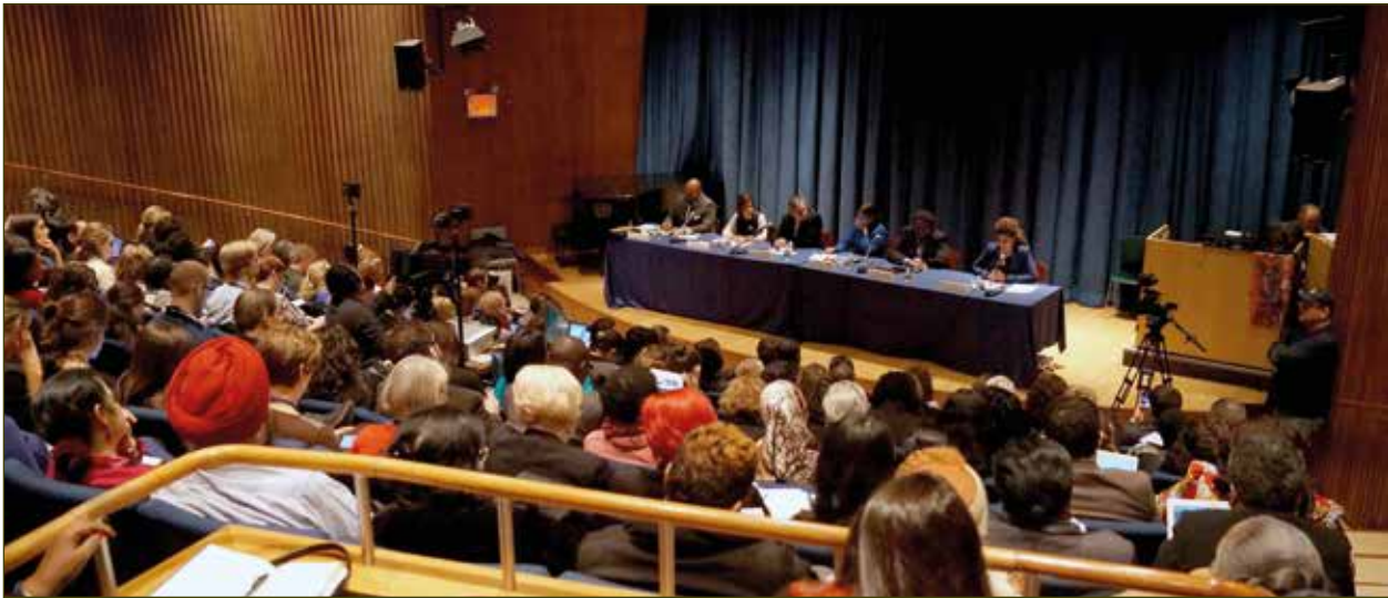
59 th Session of the Commission on the Status of Women (New York, USA)