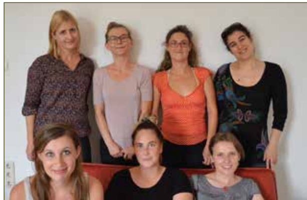
WAVE office and interns (Vienna, Austria)