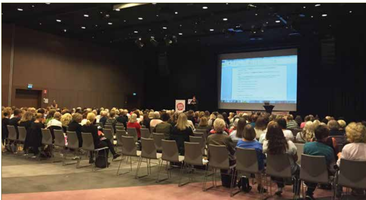
Sexualisering av det offentliga rummet/Sexualization of the Public Sphere Conference (Stockholm, Sweden)