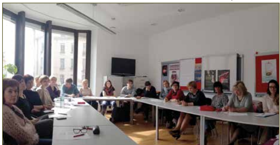
WAVE Study Visit in Vienna

In 2015, WAVE organized the study visit together with Council of Europe, gathering 16 participants from Poland in order to exchange experiences and expertise, as well as to visit the WAVE office. The participants consisted of local politicians and organizations involved with women's rights to live a life free from violence.