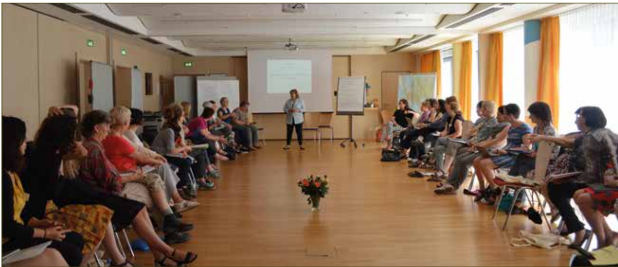
Meeting of the Advisory Board of Country Coordinators, CoCo (Vienna, Austria)

strengthening network activities (presented by the network Members from Poland, Russia, Malta, Romania, Turkey, and the Netherlands). Participants also were involved in workshops on issues ranging from WAVE campaigning on the implementation of the Istanbul Convention in Europe, to strengthening network communication and cooperation, and discussing new perspectives and innovative work in the field of combating violence against women.