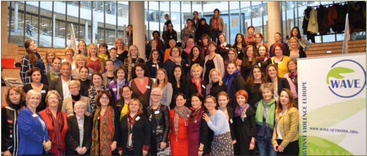
17 th WAVE Conference (The Hague, Netherlands)

Europe, relevant activities and projects carried out by WAVE Members, updates on projects involving WAVE, as well as future and current events.