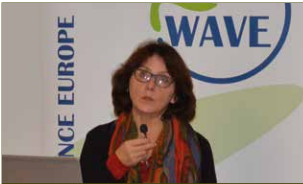
Dubravka Šimonović: “Synergies and implementation of global and regional instruments on violence against women: CEDAW and the Istanbul Convention”

During the 17 th annual WAVE Conference, Dubravka Šimonović, the UN special rapporteur on violence against women its causes and consequences, was invited to provide a keynote speech, in which she discussed two important conventions: the Convention on the Elimination of all forms of discrimination against women (CEDAW) and the Istanbul Convention, while drawing synergies between the two international conventions. The CEDAW convention entered into force in 1981 and is global in scope, while the Istanbul Convention was established in 2011 and is a regional (pan-European) framework.