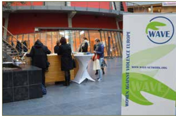
17 th Annual WAVE Conference (The Hague, Netherlands)

Since 2014, WAVE has been a Board Member of the European Network for the Work with Perpetrators of Domestic Violence (WWP-EN). The aim of this cooperation with perpetrator programmes is to ensure that