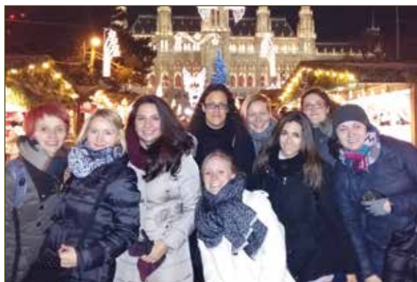
First group of WAVE Campaigners attending the Training Institute (Vienna, Austria)

Over the past 20 years, WAVE has done a lot of work to improve service provision and ensure that women receive the kind of needs and human rights-based support they require to resume a life free from violence. The WAVE Training Institute aims at uniting and strengthening the capacity of experts working in women's support services, establishing common quality standards for the support of survivors of violence