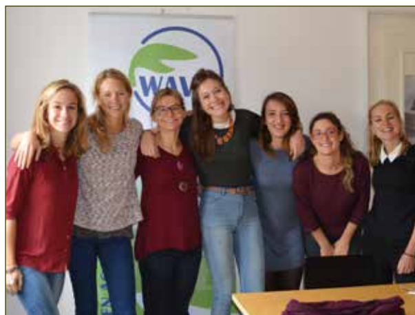
Ride for Women’s Rights (R4WR) Meeting (Vienna, Austria)

Ride 4 Women’s Rights (R4WR) is a foundation founded by four Dutch women, which actively raises awareness of women’s rights, promoting the idea that all women and girls should have the right to family planning, gender equality, and education. A key aspect of their initiative was to bike from Jakarta to Amsterdam (14,000 km), with every kilometre dedicated to women’s rights. On the last leg of their bike trip, R4WR visited the WAVE office in Vienna to discuss their project and experiences, as well as to find out more about the WAVE